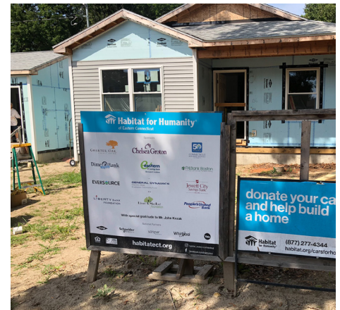
Our families and their volunteer family partners enjoyed seeing their future homes and each other.