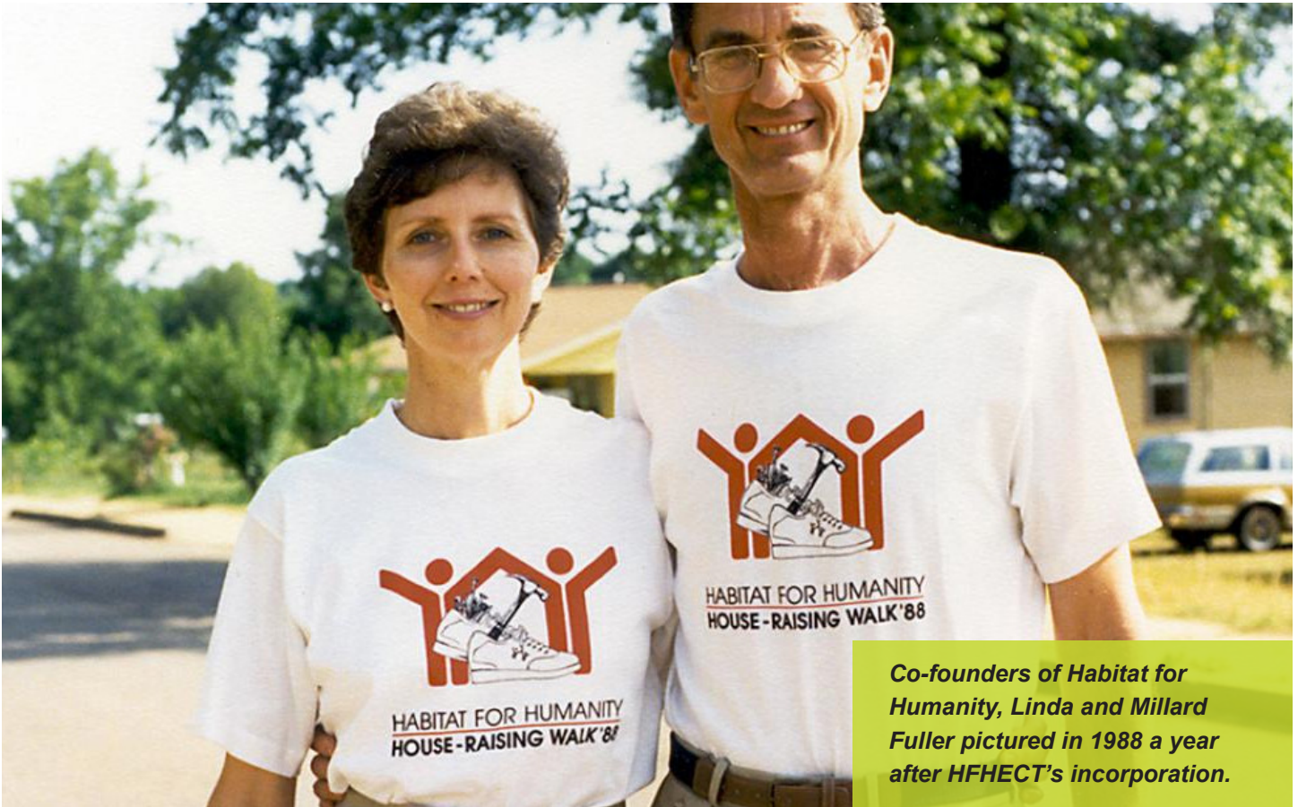
Co-founders of Habitat for Humanity, Linda and Millard Fuller pictured in 1988 a year after HFHECT's incorporation.