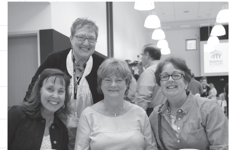
The ladies are having a blast.