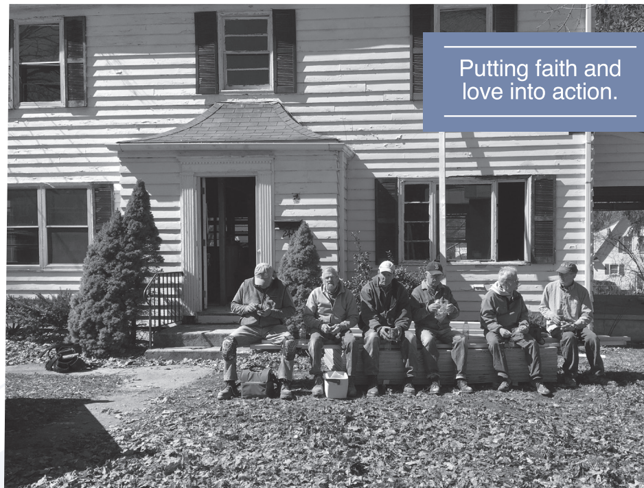
Putting faith and love into action.

The first Habitat home in Stonington Let us Rejoice and be Glad at the dedication 42 Shawondassee Drive Stonington Sunday, December 11, 3 p.m.