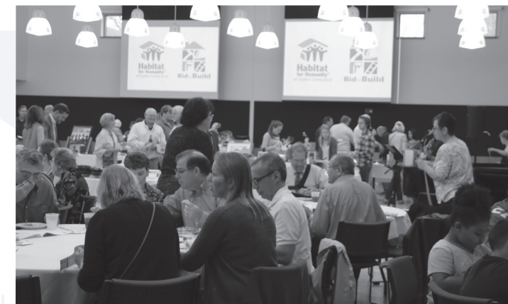
It was a full house of big hearts.

Doubling is easy. Visit CharterOak.org/content/Matching-Gifts and complete the Charter Oak Matching Gifts Request Form. Send completed form with your gift to Habitat for Humanity of Eastern Connecticut, 377 Broad Street, New London, CT 06320. For more information, contact HFHECT, 860.442.7890, x204.