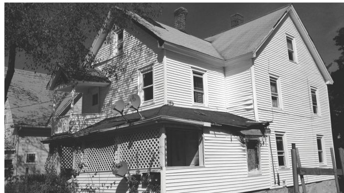
43 Summer Street, New London