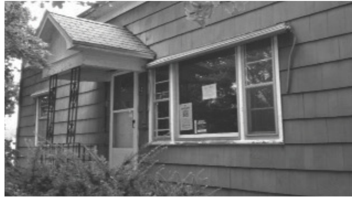
12 Western Avenue, Norwich

To volunteer, please go to: www.habitat.org/volunteers .