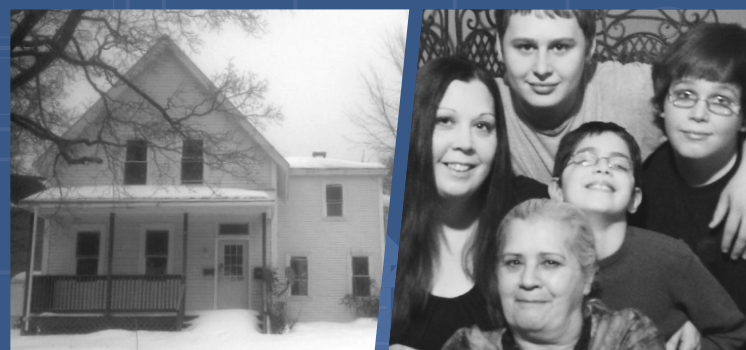
76 Mechanic Street, Killingly - Diamond Family