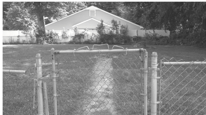
8-12 Winsor Avenue, Plainfield