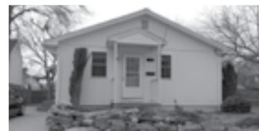
90 Van Den Noort Street, Putnam