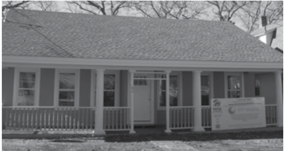
The Quilter Family and their new home on 66 Raymond Street in New London.