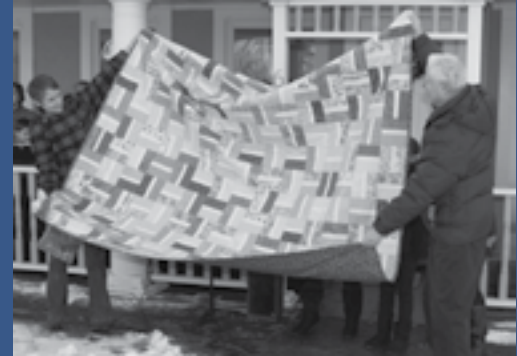
A quilt has been given to every homeowner by the United Methodist Church of Gales Ferry

Habitat for Humanity of Eastern Connecticut is excited to host its annual Faith Breakfast on Wednesday May 14 at the United Methodist Church of Gales Ferry. This is an opportunity to learn about HFHECT's current work and opportunities to be involved.