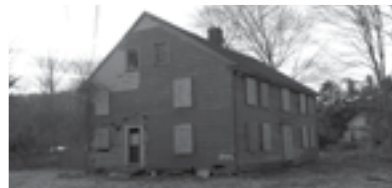
344 Maple Avenue, Montville