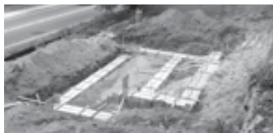
111 Flanders Road, Niantic

For information on sponsorship and financial support, please contact Amy D'Amico at 860-442-7890 x204 or adamico@habitatct.org .