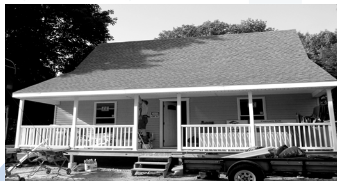
344 Maple Avenue, Montville