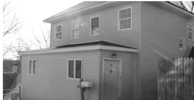
6 Clairmont Court, Norwich