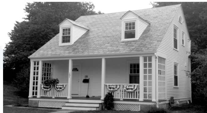
151 Lincoln Avenue, New London