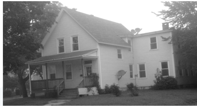
76 Mechanic Street, Killingly