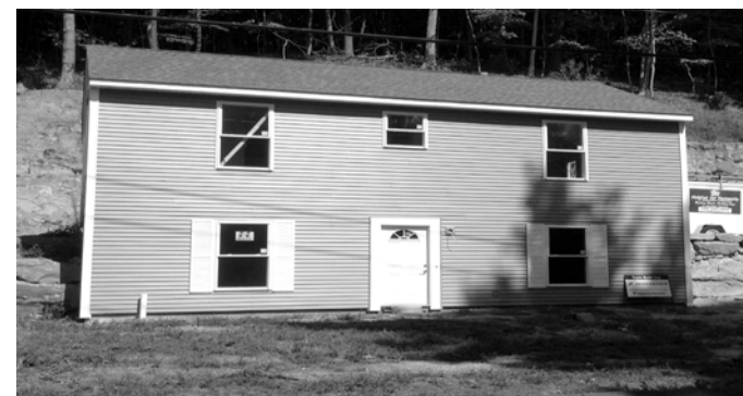
111 Flanders Road in, Niantic

Habitat for Humanity has completed two new home construction projects: 344 Maple Avenue in Montville, 111 Flanders Road in Niantic, and one home rehabilitation at 151 Lincoln Avenue in New London. All of these homes represent an incredible community effort combining generous funding, donations of property, and of course, thousands of volunteer construction hours. Thank you for helping to make these homes possible!