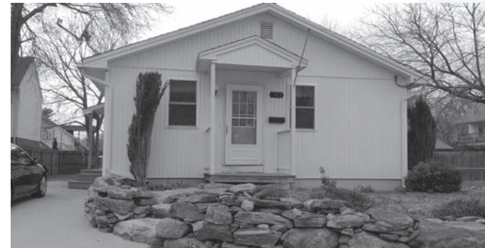
90 Van Den Noort Street, Putnam

Habitat for Humanity of Eastern Connecticut has been blessed to receive several donations of vacant homes, and this fall the affiliate is working throughout the service area on home rehabilitations. We look forward to transforming the vacant houses into vibrant homes! If you would like to help on any of these homes, please visit www.habitatct.org/volunteers .