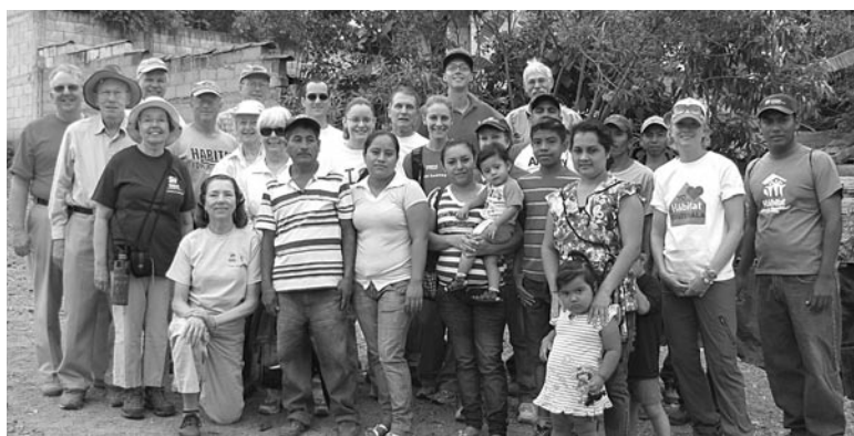
HFHSECT pose with Habitat for Humanity Guatemala staff and homeowner families.