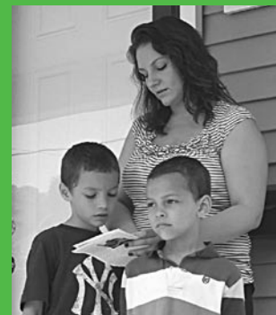
The Cudzilo Family 51 Fairmount St. Norwich