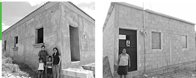
The two homes HFHSECT's volunteers helped build in March 2012

HFHSECT tithes 10% of all its unrestricted donations to Habitat for Humanity affiliates in Guatemala, Egypt and Haiti.