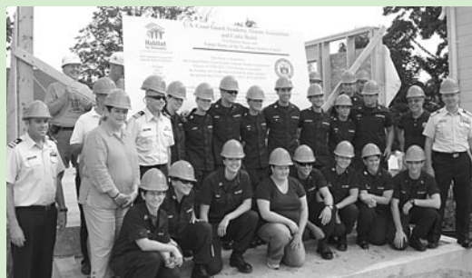
The wall-raising at 9 Jefferson Avenue.